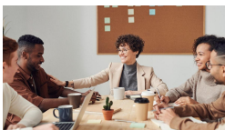
Health and Safety Representative (HSR) Basic Training