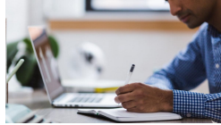
JHSC Certification Part 2, General Workplace Specific Hazards