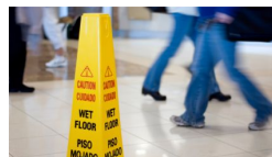
Slips Trips and Fall Prevention