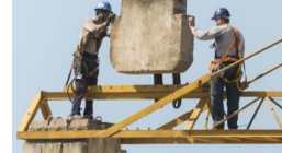
Working at Heights