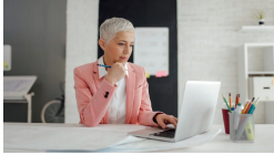
JHSC Certification Part 1