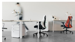
eOfficeErgo: Ergonomics eLearning for Office Workers